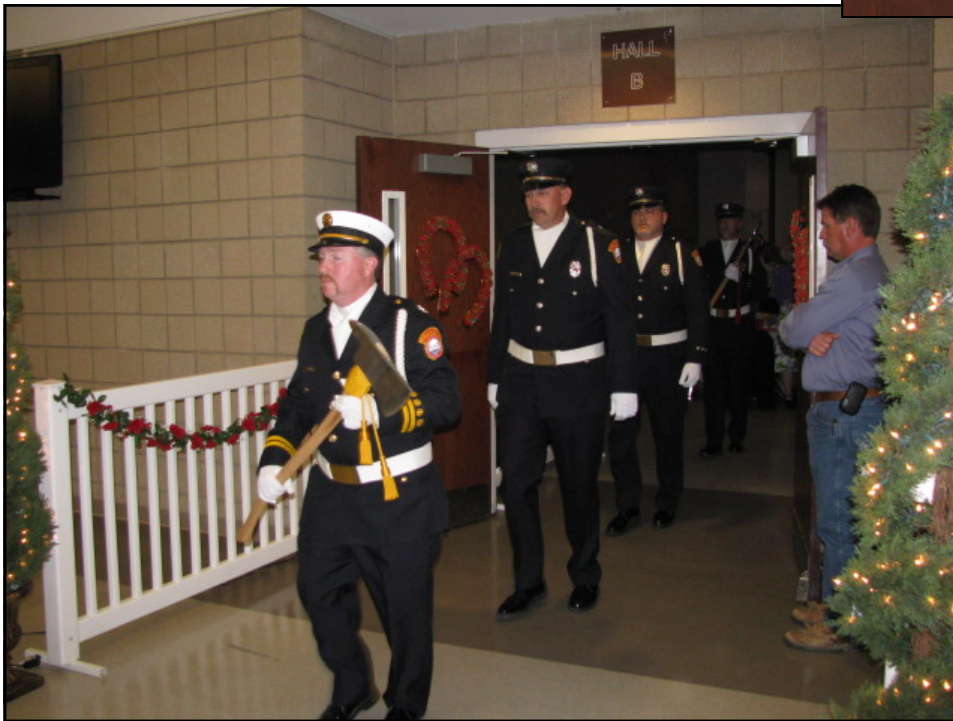
Williamston Fire/Rescue/EMS color guard presented the national and state flags.